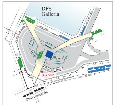
① Map of “Omoromachi” Station Area