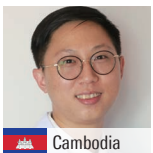
San Samrangy Cambodia