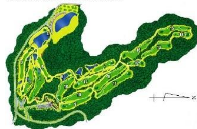
Karuizawa Asama Golf Course

Closed: Irregular holidays/ Winter closure in effect.